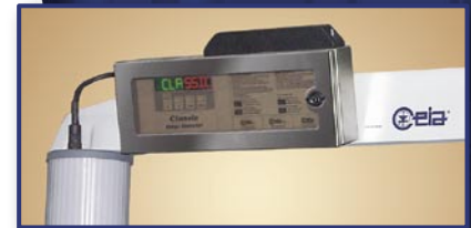
Classic/Navy MODEL IS PARTICULARLY SUITABLE FOR ENVIRONMENTS WITH LIMITED HEADROOM, AND FEATURES AN ELECTRONICS UNIT IN A STAINLESS STEEL IP55 CONTAINER.

CEIA , the world leading manufacturer of Metal Detectors, presents the Classic . This Walk-Through Metal Detector is engineered and designed to meet the specific security needs of public facilities such as: schools, hotels, amusement parks and city halls. The Classic provides the required security with a high level of operating efficiency. The leading edge technology features a high flow rate of people through the gate with minimal alarms. Personal items such as coins, keys, belt buckles can pass through the magnetic field without causing an alarm. The Classic Metal Detector is compact and lightweight making this portable unit adoptable to any surroundings. The patented cylinder design is aesthetically suitable for the most discrete applications. This security equipment does not require any special training for normal use making this the most "user friendly" walk-through metal detector in the industry. CEIA metal detectors have been selected by the leading security agencies worldwide to protect high ranking government officials. The Classic conforms to all International Security Standards and is capable of detecting both magnetic and non-magnetic weapons. When security, operating efficiency and affordable pricing are required the CEIA Classic metal detector is the solution. The Classic is manufactured using the most advanced electronics technology, conforming to ISO 9001 Quality Control Standard procedures.