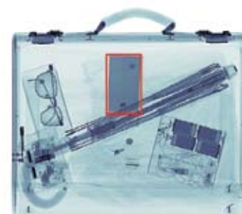
Example of DEXGIL automatic explosive alert in an apparently innocuous luggage